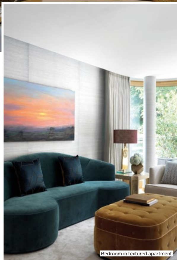
Bedroom in textured apartment

Miyar's interiors are infused with handmade, tactile objects to create serene, storied spaces. It's no wonder then that the Atelier has gained such a big reputation in such a short time.