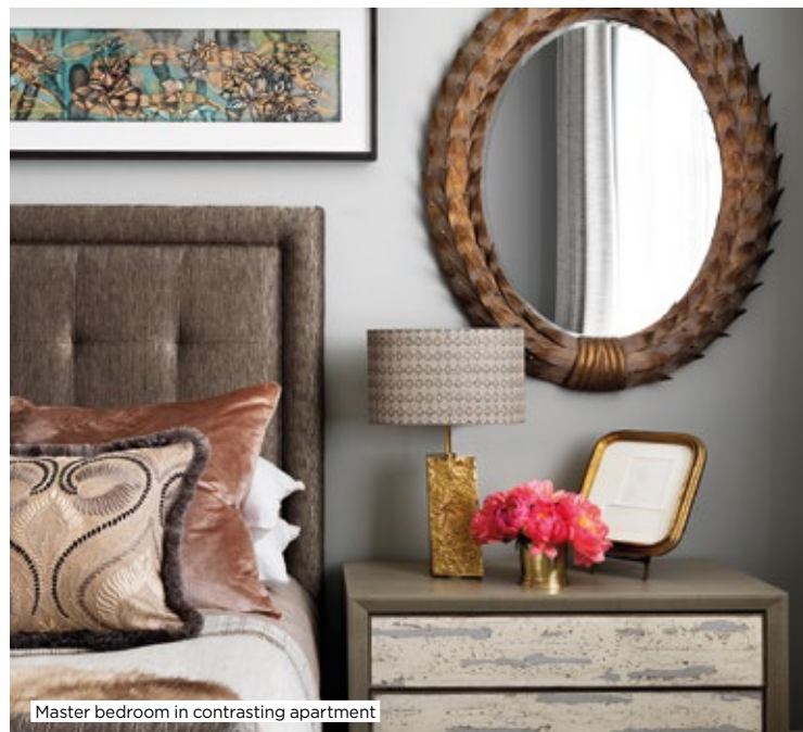
Master bedroom in contrasting apartment