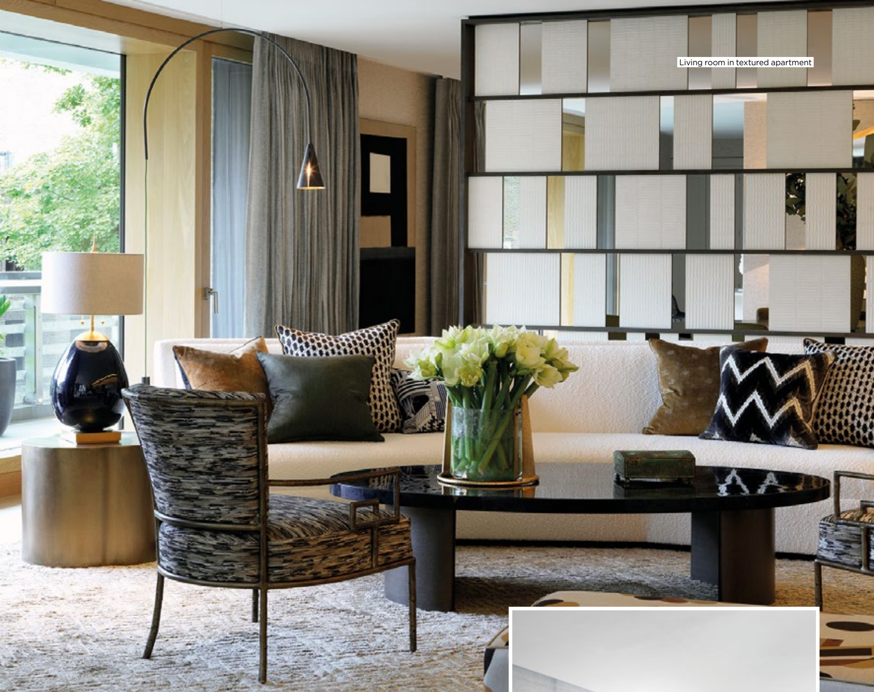
Living room in textured apartment