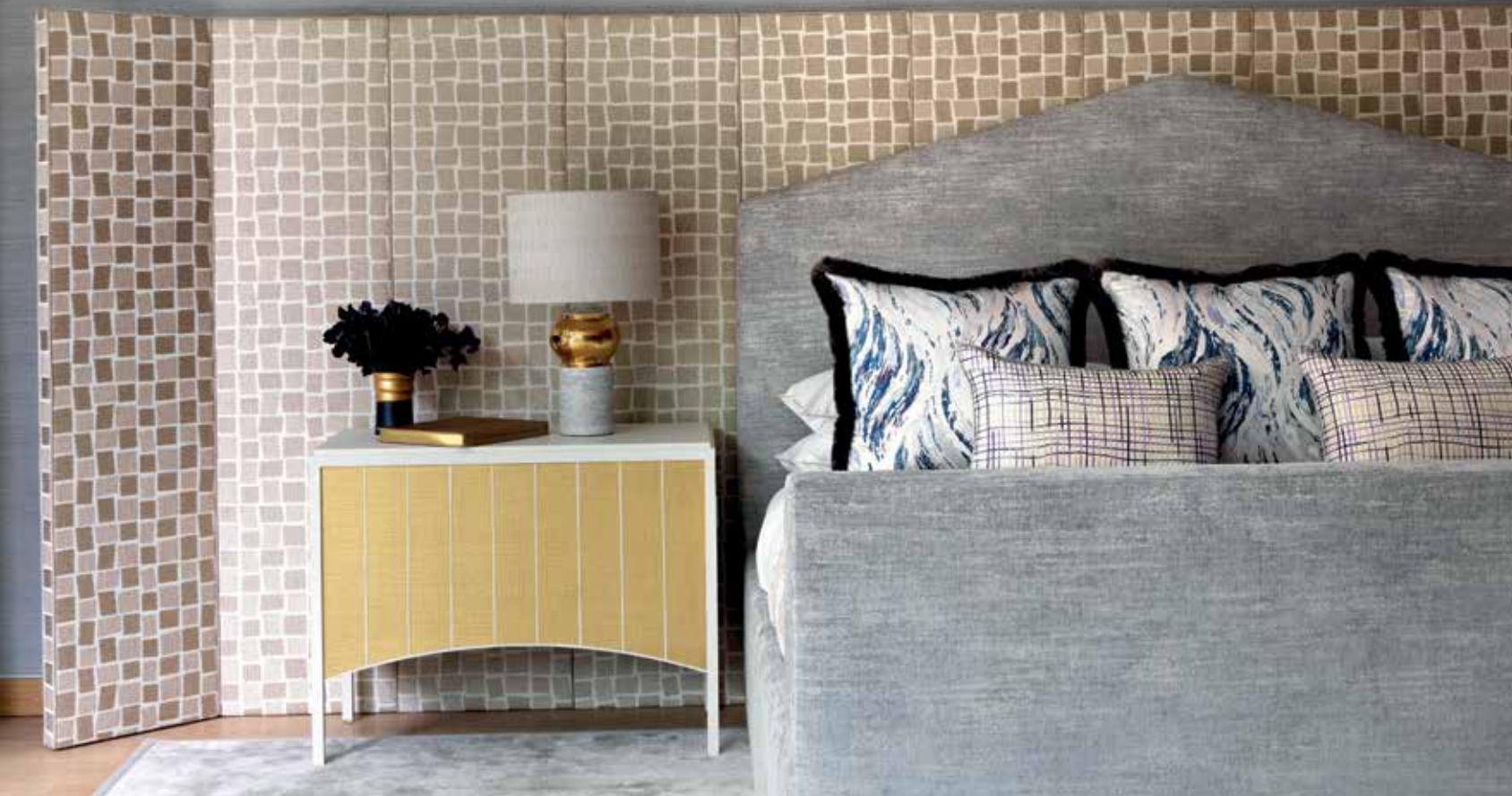
Clockwise from above Natalia added a custom-made screen in Zimmer + Rohde Powell Embroidery behind the bespoke NMA bed to give the large master bedroom added depth and tactility. The lounge area of the master bedroom is furnished in custom pieces upholstered in sumptuous jewel-tone fabrics from Rubelli and Alton Brooke. Ahmed Gomez's painting Instrumental Beauty IV complements the scheme in this guest bedroom. Natalia's love for textured fabrics is evident in this bedroom: the bedding is bespoke by NMA, the headboard custom-made in Dedar fabric, and the wallpaper is Phillip Jeffries' 3532 Metallic Paper Weaves Sulfur.