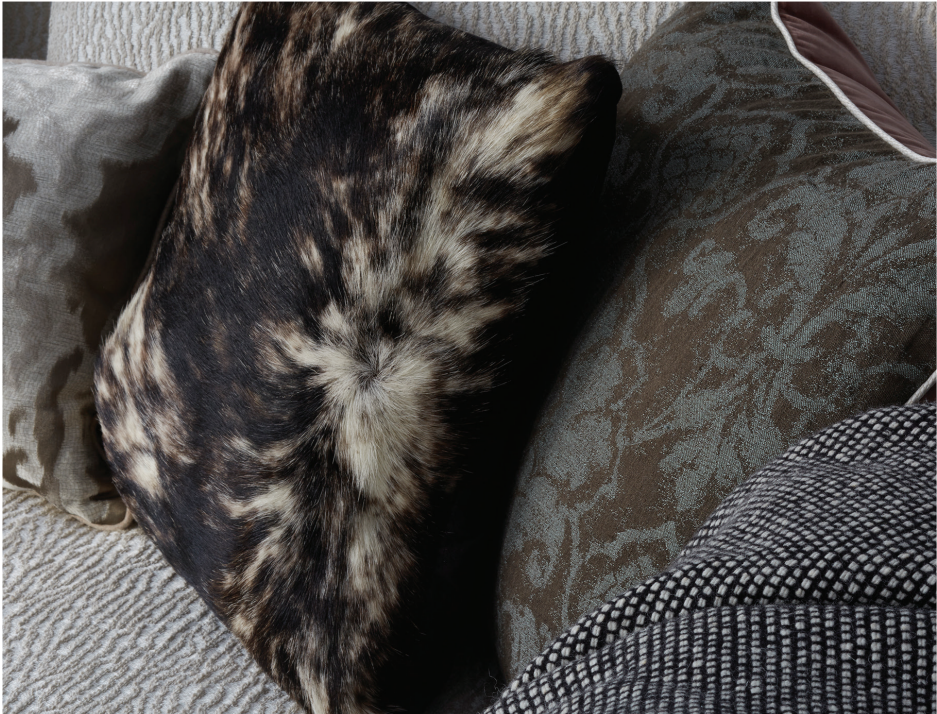
Above: Faux furs and fabrics create depth, warmth and add a sense of fun to interior schemes