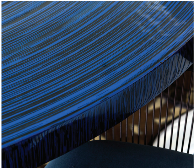
Above: Classic Blue is Pantone's Colour of the year for 2020

Recently I've noticed that most of my clients absolutely love velvet and are always keen for it to be used in the design scheme in